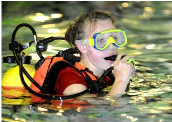
A "Try Dive"

Once you have completed the 'Ocean Diver' course you can progress on to the next level, 'Sports Diver'. For details of the diver and training grades see the ' BSAC Diver Grades ' section.